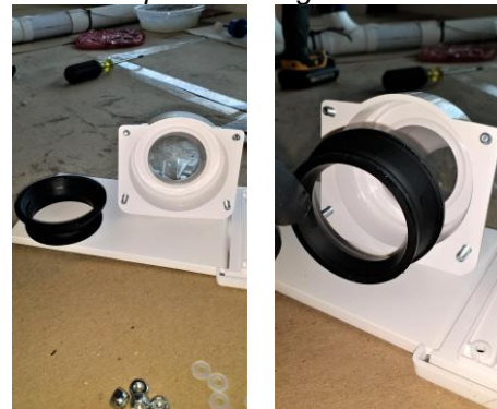
Replace locking sleeve

Step 4 > Re-assemble valve. Tighten only until snug.